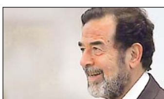
Saddam Hussein: Back in court

➤ Saddam Hussein calls on Iraqis to "forgive, reconcile and shake hands" two days after he was sentenced to death in a separate case, which was automatically appealed. WORLD, A18