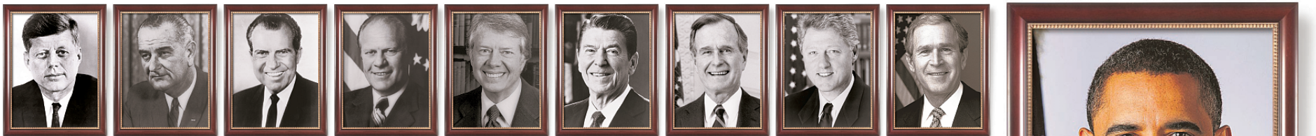
35. John F. Kennedy 36. Lyndon B. Johnson 37. Richard M. Nixon 38. Gerald R. Ford 39. Jimmy Carter 40. Ronald Reagan 41. George H.W. Bush 42. William J. Clinton 43. George W. Bush