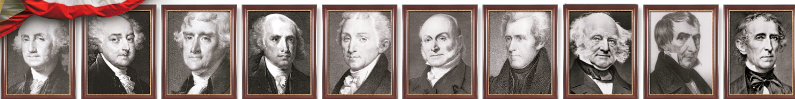
1. George Washington 2. John Adams 3. Thomas Jefferson 4. James Madison 5. James Monroe 6. John Q. Adams 7. Andrew Jackson 8. Martin Van Buren 9. William H. Harrison 10. John Tyler

INAUGURATION DAY » The events of this historic day begin at 9:30 a.m. MST, with Barack Obama taking the oath of office just before 10 a.m. The parade follows and the inaugural balls take the celebration into the night. Go to www.sltrib.com for stories, photo galleries and an interactive blog — constantly updated throughout the day.