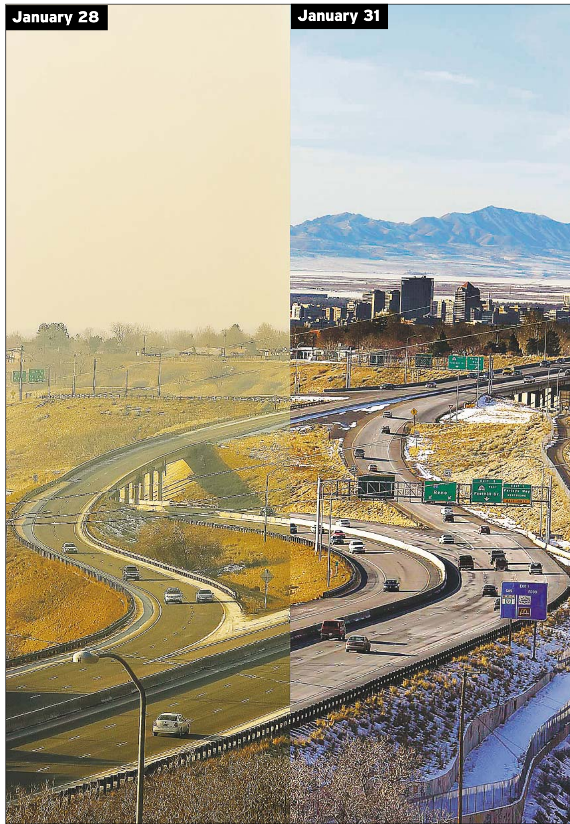
THE VIEW OF DOWNTOWN SALT LAKE CITY and Interstate 215 from the mouth of Parleys Canyon before and after a small snowstorm blew through town Wednesday and cleared away much of the haze that had been suffocating the valley for weeks. SEE PAGE B3